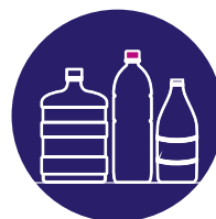
TGR For plastic industry