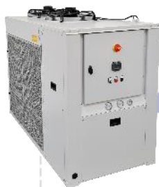
CEN-HEN from 10 to 96 kW