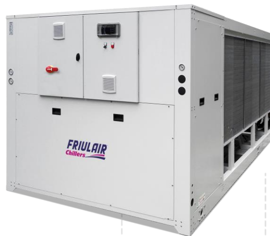
CFT from 100 to 300 kW