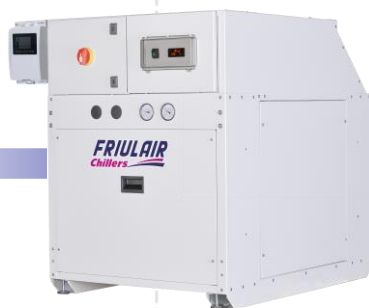
MWC from 21 to 115 kW